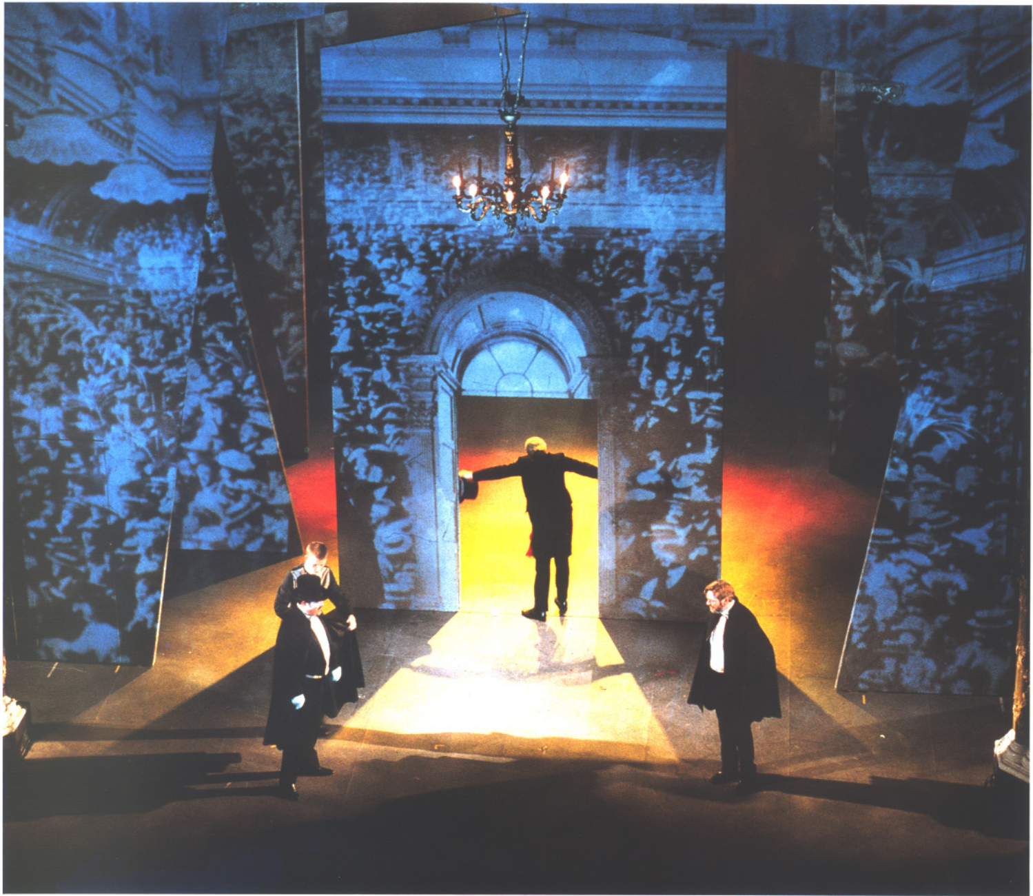
IMAGINATION'S VISION FOR THE RISEN PEOPLE.